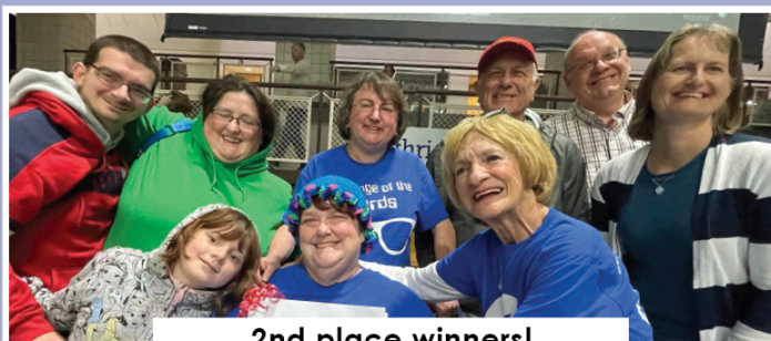
2nd place winners! Team "Revenge of the Nerds"