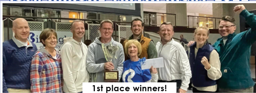
1st place winners! Team "Suk it Trebek"