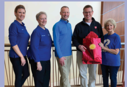
2nd place winners! Team "Suk it Trebek"

Helping expectant mothers & their babies in Quincy since 1973.