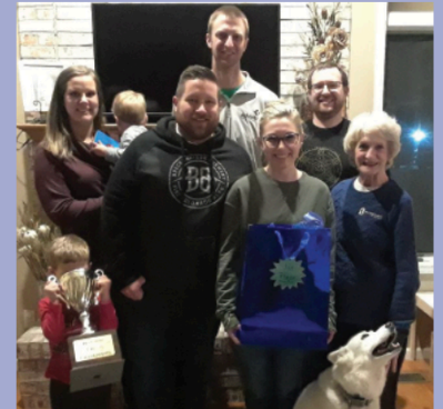
1st place winners! Team "Why Google Sinatra when you can Bing Crosby?"