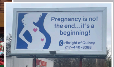
Our first-ever billboard donated by an anonymous supporter!

Our new location is 1200 Broadway, in the lower level of the Zanger Realty building. We feel so blessed to be in the Zanger building (again)! Thank you to our area pastors, deacon, and priest who came to offer special blessings for our new office space!