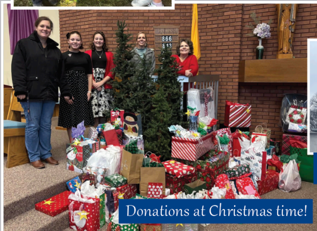
Donations at Christmas time!