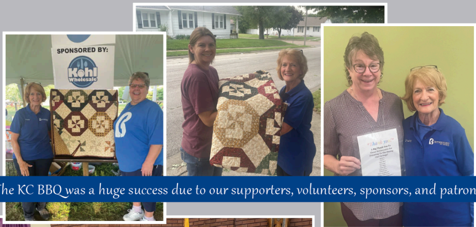
The KC BBQ was a huge success due to our supporters, volunteers, sponsors, and patrons!